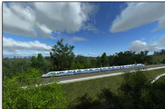
China Rail High Speed Rail Track